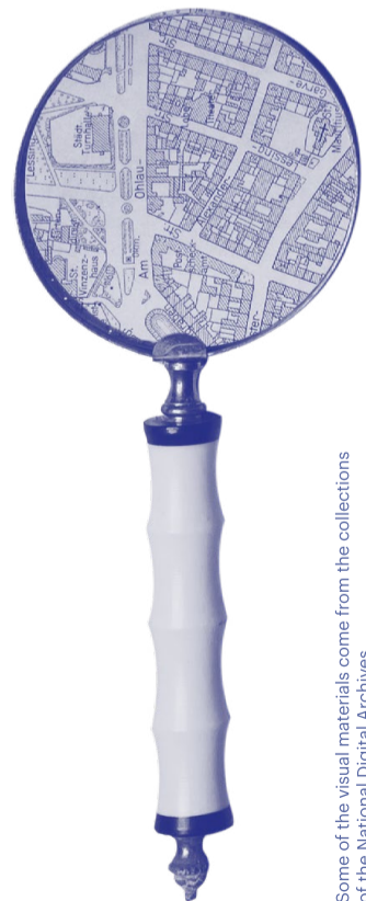
Some of the visual materials come from the collections of the National Digital Archives

We wish you successful neighbourhood journeys!